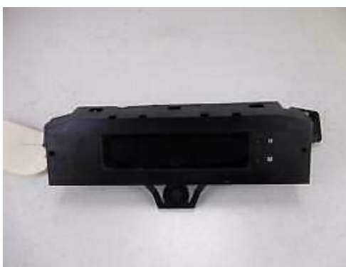
Changer ampoule compteur twingo 1. Ampoule compteur twingo 1 phase 2. Ampoule led compteur twingo 1.